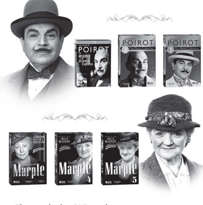
See your favorite detectives come to life on screen!

These and other DVDs and downloads available now at: www.acornonline.com